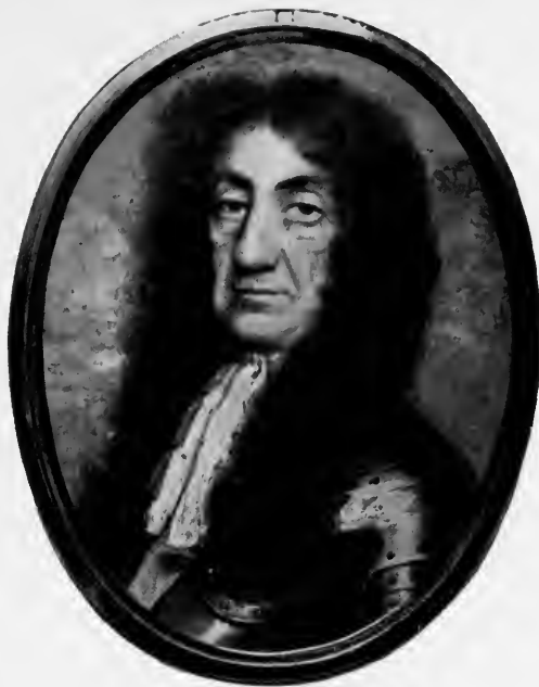
CHARLES II BY SAMUEL COOPER